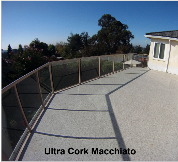
Ultra Cork Macchiato

Joining the initial, organic-looking Ultra Cork Natural that launched this popular pattern, the Ultra Cork Macchiato and Ultra Cork Espresso offer deeper, richer color options to the earthy texture of the Ultra Cork line.