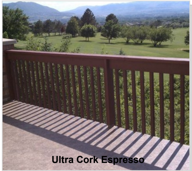
Ultra Cork Espresso